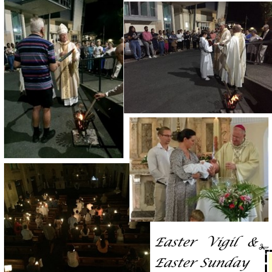
Easter Vigil & Easter Sunday

GOOD FRIDAY COLLECTION Thank you for supporting this collection as encouraged by Pope Francis. You join with Catholics around the world to stand in solidarity with the Church in the Holy Land and become an instrument of peace in the land where Jesus walked. The parish total for this collection was $400.00